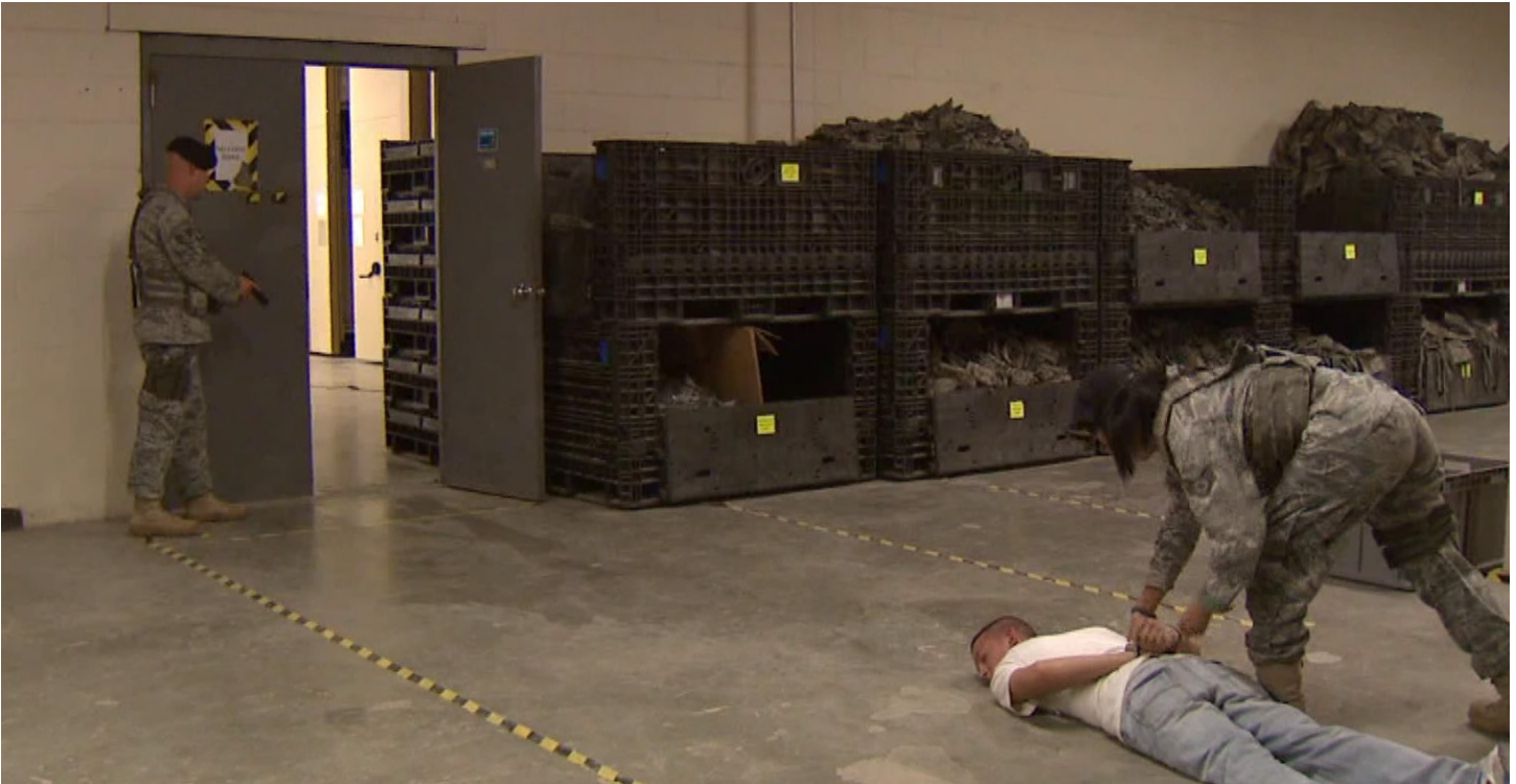
Judgmental training highlights verbal de-escalation with lethal/less-lethal force options

simulated weapons can be assigned to a single user. These include: